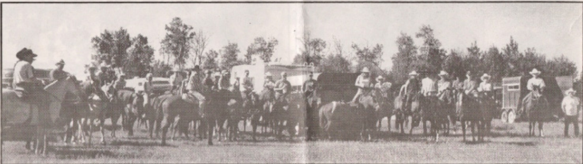
Participants of the 1997 Telemiracle Trail ride.